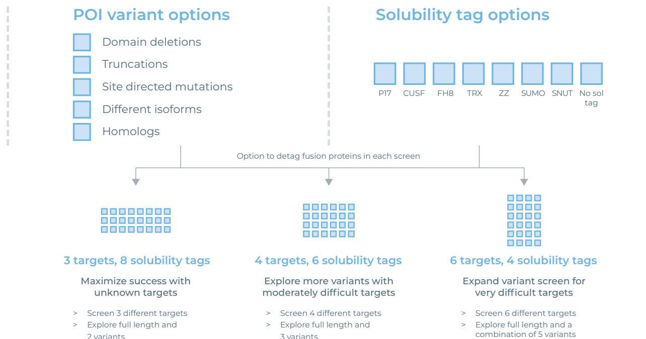
Figure 2. eGene Prep Kit: Solubility Tag Screen - an overview of the possible solubility tag options and screening strategies.

7 solubility tags were carefully curated to be included in the eGene Prep Kit: Solubility Tag Screen. These 7 solubility tags were selected based on the unique properties of each and their proven ability to solubilize target proteins when added to the N-terminus of a protein. The unique feature of each solubility tag is described in Table 1. Also included in the standard screen is a construct that does not contain any solubility tag; with only purification and detection tags added. That way, users can identify if solubility tags confer added benefits and decide to pick a construct with or without solubility tags to work on, Figure 2. Simultaneously testing multiple versions of the same synthesized DNA will save on financial costs, as opposed to sequential testing of the same synthesized DNA.