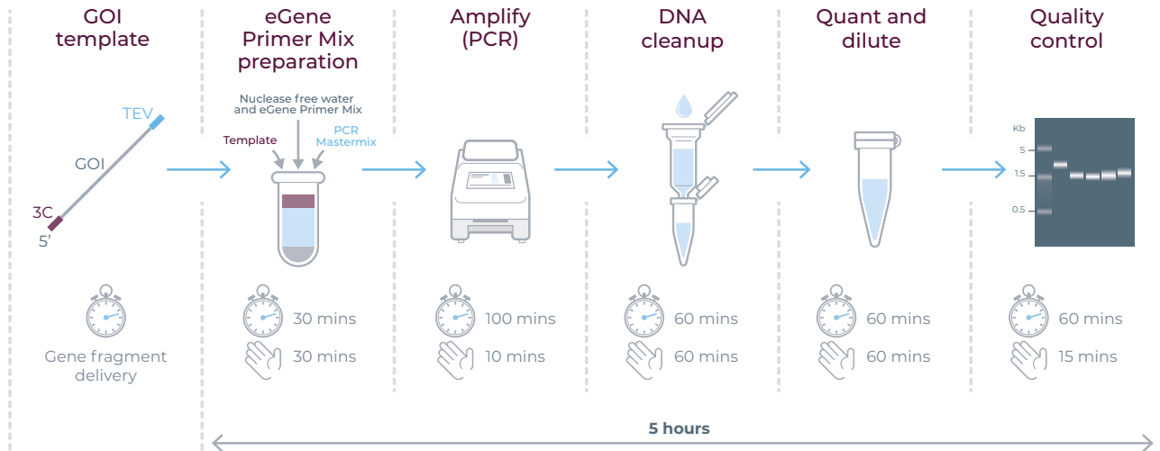
Figure 4. eGene workflow summary - timings applicable for generating eGene constructs using the eGene Prep Kit: Solubility Tag Screen and eGene Prep Kit: FlexiVariant™ Screen.

After receiving the eGene template, the PCR reaction is set up which contains the eGene template mixed with PCR master mix and the eGene Primer Mix reagents which comprise of the megaprimers, provided in the eGene Prep Kit. The resulting PCR eGene product can be purified using either a spin column or bead purification technique. The purified DNA product is then quantified and normalized to 5 nM for use on the eProtein Discovery platform. Users are encouraged to run a small quantity of DNA on an agarose gel to ascertain the quality of the DNA constructs generated.